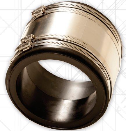
Amazon Shear Ring

The Shear Ring and Amazon Shear Ring couplings offer joint protection from shear failure through the use of a stainless steel shear band. Through the use of the 300 series stainless steel, the Shear Ring and Amazon Shear Ring couplings are corrosion resistant. Available with both the Shear Ring (.007 Stainless Steel band wall thickness) and Amazon Shear Ring (.012 Stainless Steel band Wall thickness) shields.