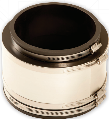
Step Down Coupler

Cost Savings: Helps eliminate costly repairs by reinforcing the joint with the Shear Ring and Amazon Shear Ring shields.